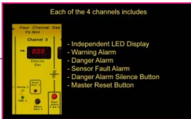
Each of the 4 channels includes