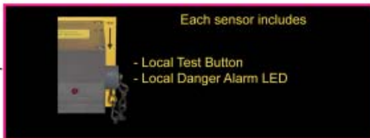
Each sensor includes