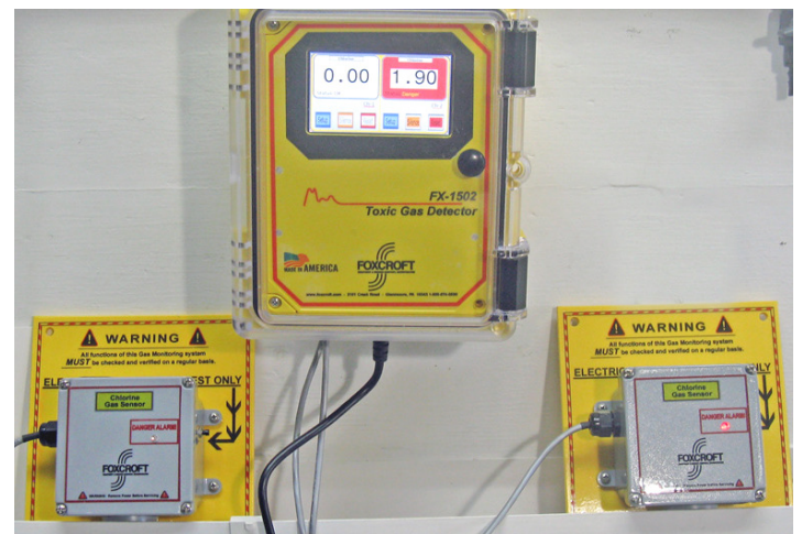
Dual Channel FX-1502v4