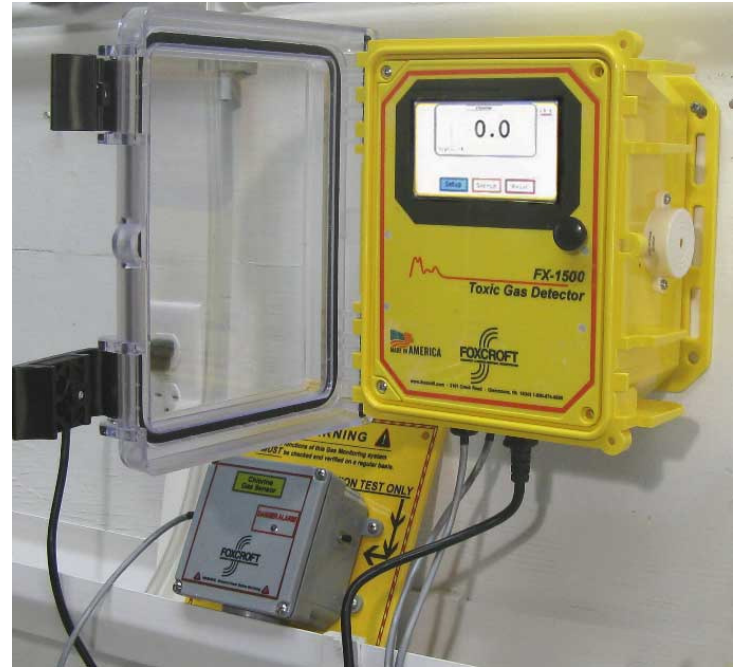
Single Channel FX-1500v4